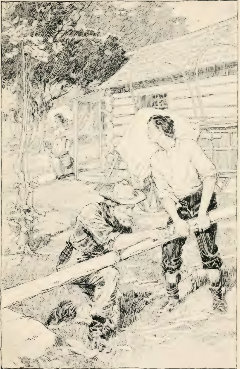
“ At that moment a young girl passed from the kitchen door to the spring for a bucket of water.”